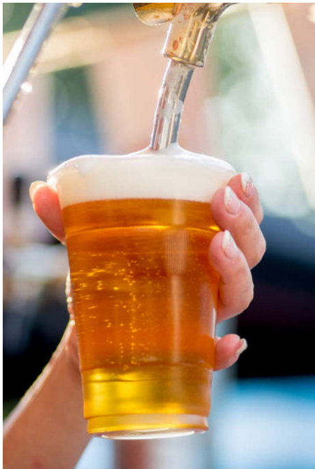
Beer and Cider Drinks

CO 2 Vapour Polishing Multi Stage Filtration for the Beverage Industry