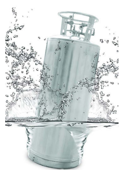
and other high purity applications